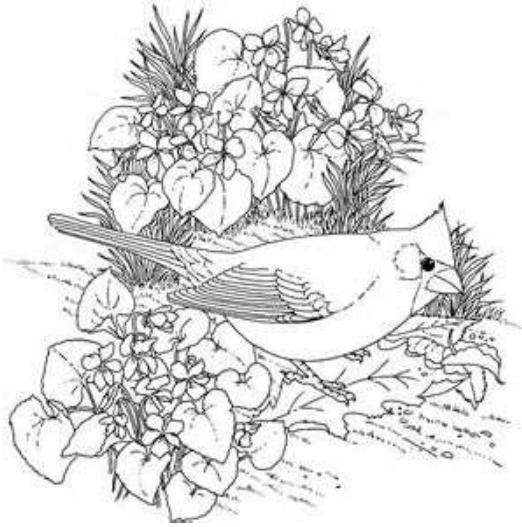
Illinois State Bird: Northern Cardinal