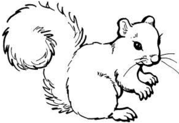
North Carolina State Animal: Gray Squirrel