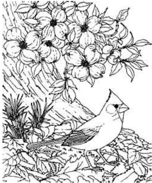
North Carolina State Bird: Cardinal