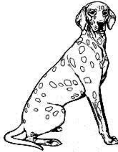
North Carolina State Dog: Plott Hound