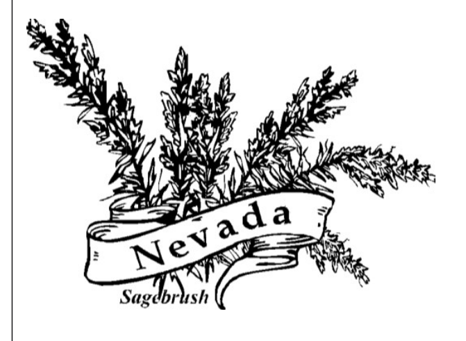
Nevada State Flower: Sagebrush