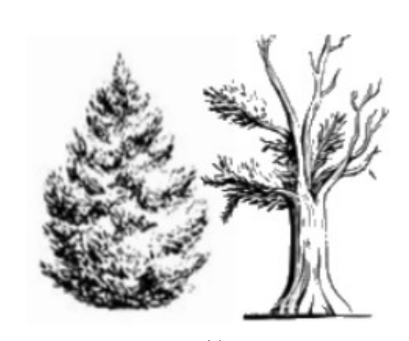
Nevada States Tree: Single-Leaf Pinon and Bristlecone Pine