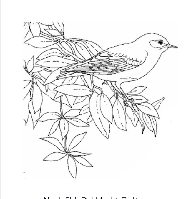
Nevada State Bird: Mountain Bluebird